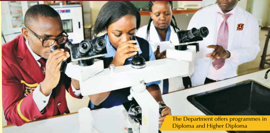
The Department offers programmes in Diploma and Higher Diploma