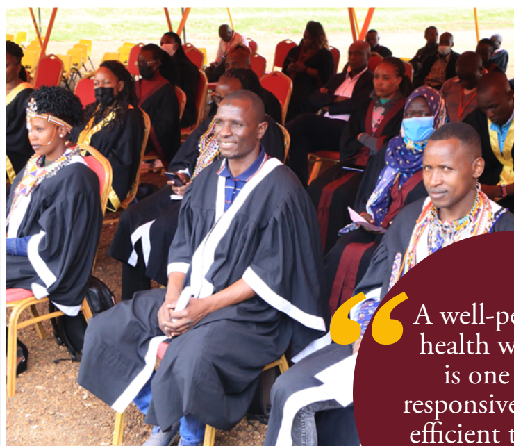
Graduands follow proceedings