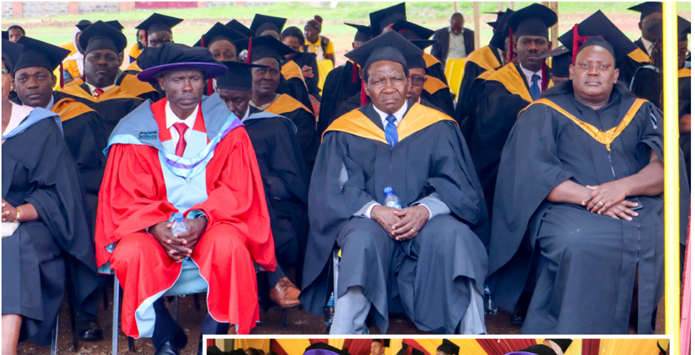
A section of KMTC Campus Principals during the graduation ceremony