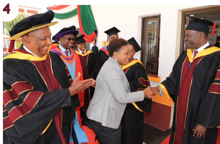
Photo (2-4). Health CS Susan Nakhumicha being received at KMTC by the Board of Directors and Management