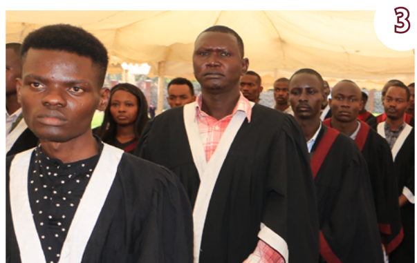
(Photo 1-3) A section of graduands reciting the Solemn Promise