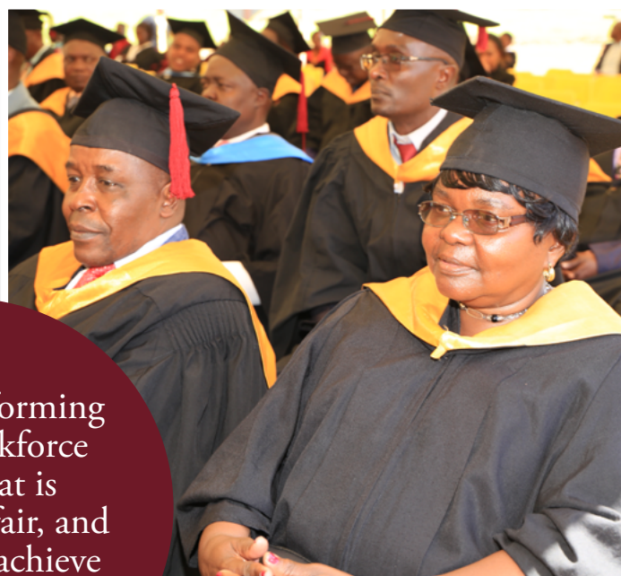
A section of Principals at the graduation square during the ceremony

“A well-performing health workforce is one that is responsive, fair, and efficient to achieve the best health outcomes.”