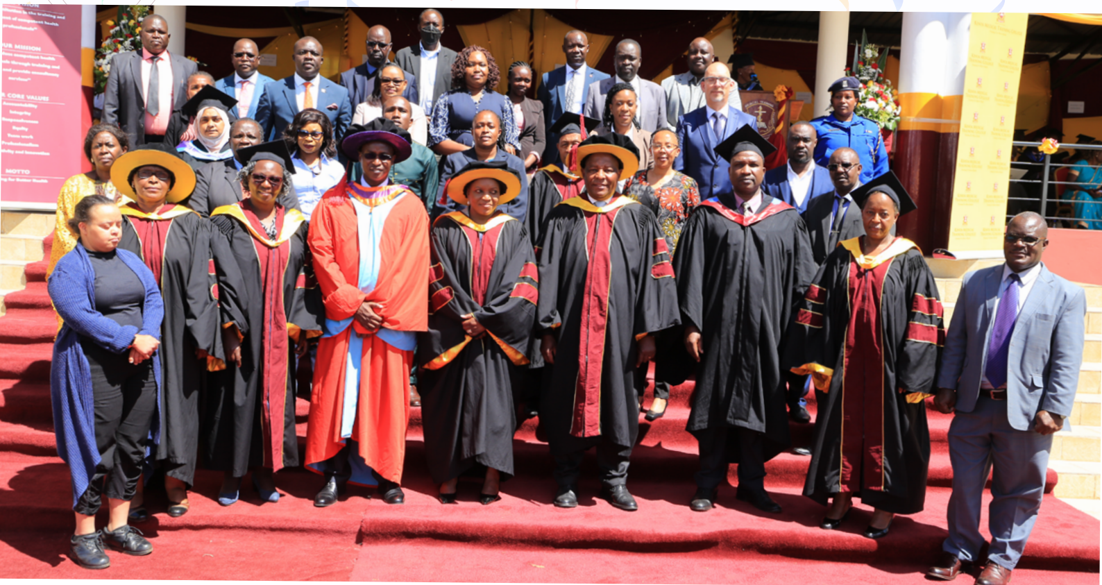
Board Directors with Key guests