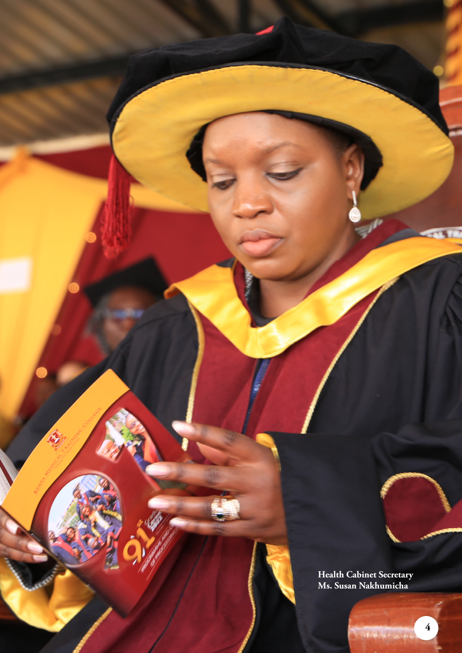
Health Cabinet Secretary Ms. Susan Nakhumicha