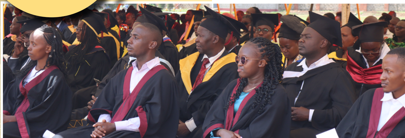
Graduands patiently waiting to be declared graduates

“ In life it is not where you start but where you finish that counts ”