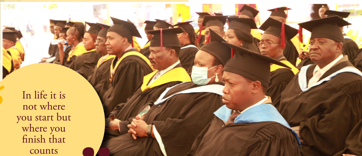
A section of the Principals in attendance

“ In life it is not where you start but where you finish that counts ”