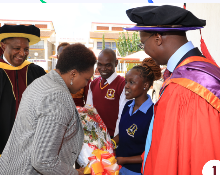
The Chief Guest, Health Cabinet Secretary Ms. Susan Nakhumicha receives a bouquet of flowers from KMTC students on arrival at the College