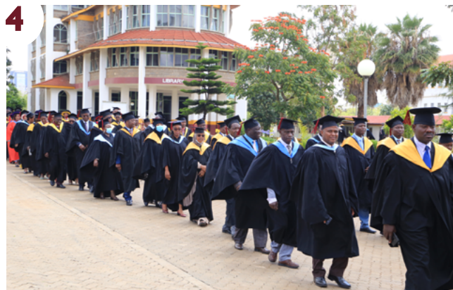
Photos 1,2,3,4: A section of Campus Principals, Academic Heads of Department and Senior Management in the Academic Procession during the graduation