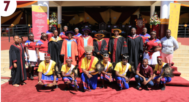
Graduation entertainment teams; Photos; 1-7 KMTC Kitui, Embu, Sigowet, Karen, Nyeri, Nairobi and Mombasa