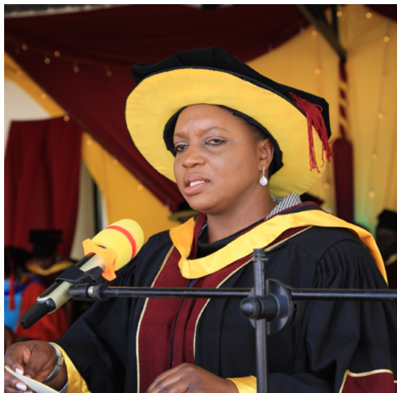
Health Cabinet Secretary, Ms. Susan Nakhumicha

Allow me to begin by congratulating you all, the graduands of 2022 on your graduation today. I feel greatly honored and privileged to be the Chief Guest at this 91 st Graduation Ceremony. Today we celebrate 15,915 Health Professionals.