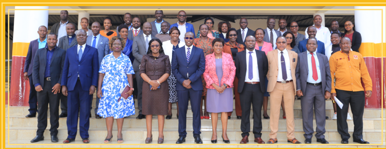
A section of the Graduation Steering Committee