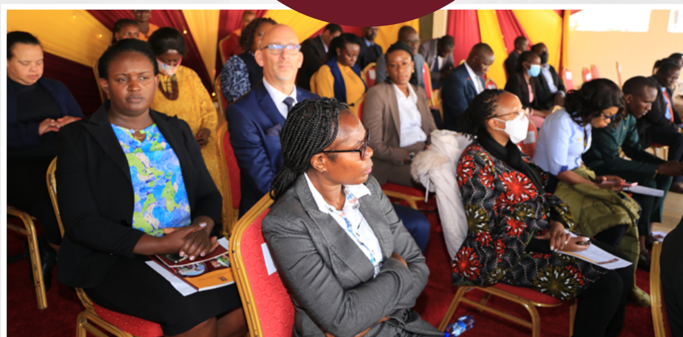
A section of invited guests during the graduation

“A well-performing health workforce is one that is responsive, fair, and efficient to achieve the best health outcomes.”