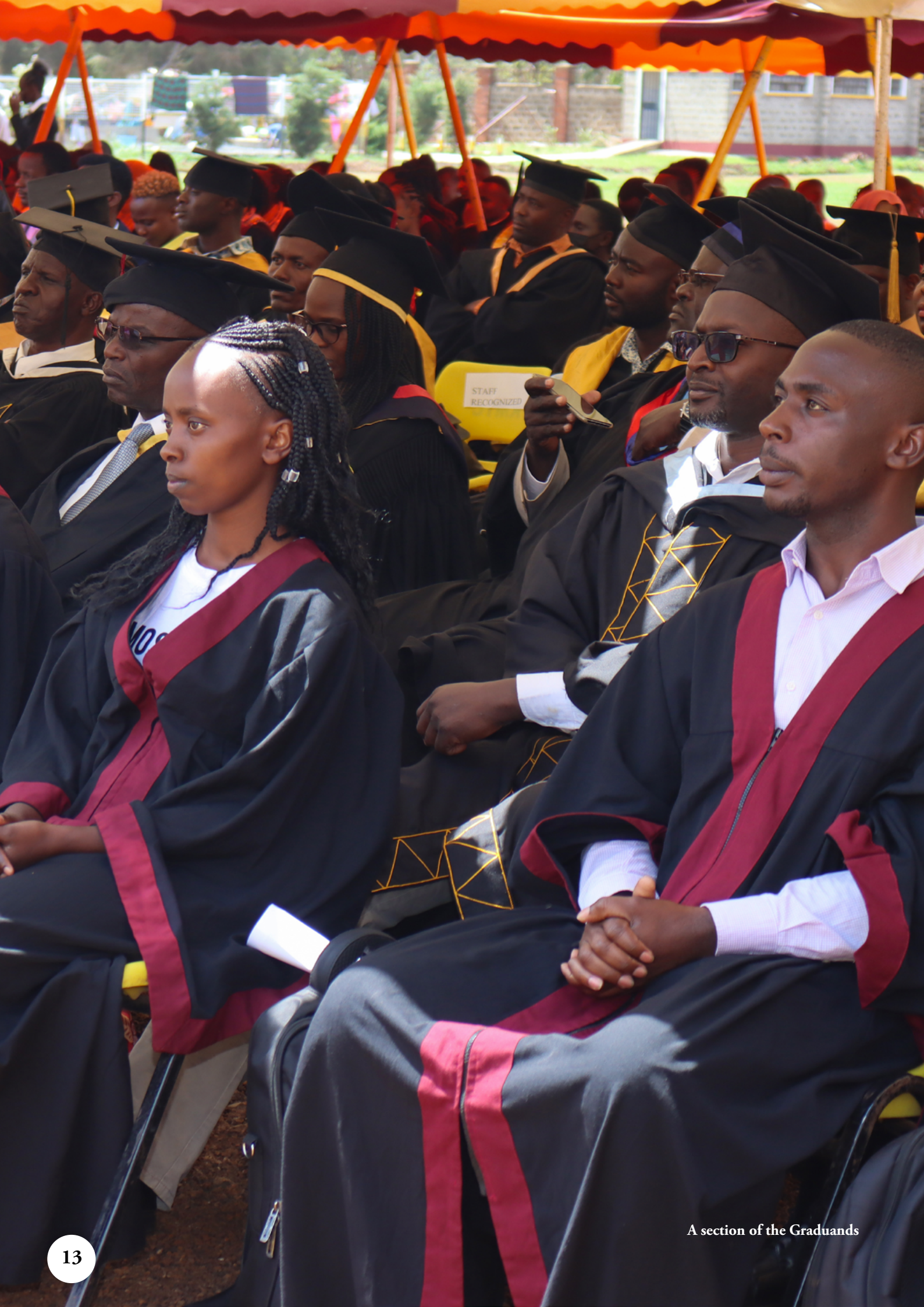
A section of the Graduands