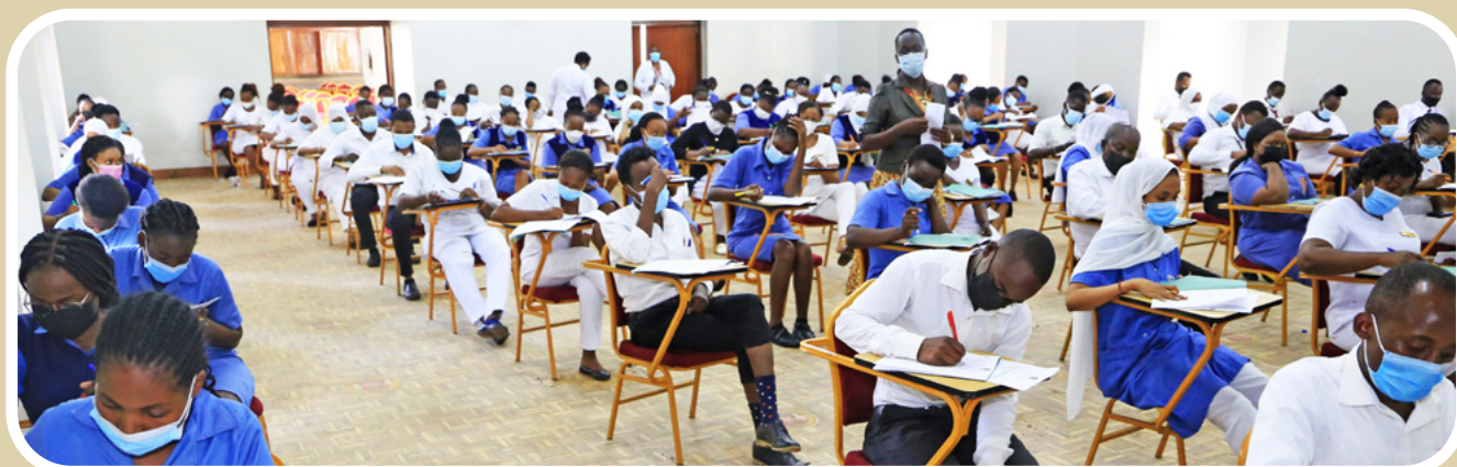
Students in examination room during FQE

We hope you enjoy reading this Bulletin and we look forward to your feedback for future improvement.