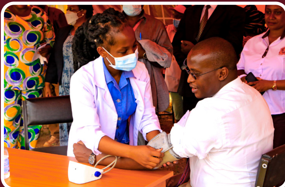
CEO Dr. Kelly Oluoch during the official opening of the camp >>>

M ore than 1,500 people benefitted from a 3-day free medical camp organized by the Kenya Medical Training College (KMTC) in Mutomo, Kitui County, as part of its long-standing strategy of giving back to the community. The main highlights of the camp were free medicines, free cervical, prostate cancer, and diabetic screening; blood pressure, eye and ear check-ups; COVID-19 vaccination, nutritional assessment, psycho-social support, and free doctor consultation.