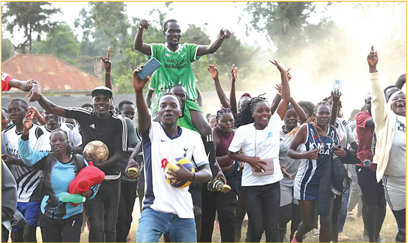
Zone 6 KMTC Sports Competition at Kakamega School.