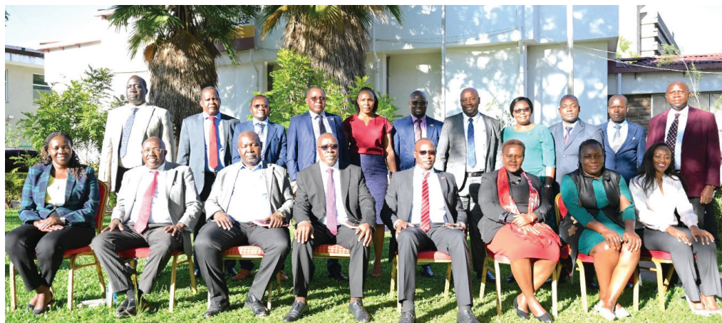
A section of the Board of Directors, Management and the newly elected leaders of the Principals Forum

In a significant move to strengthen academic leadership and enhance the quality of training at the Kenya Medical Training College (KMTC), Principals from various campuses gathered in Nairobi for a four-day academic council forum. The meeting, which commenced on March 24, 2025, at the KMTC Nursing Hall, served as a platform for key discussions on academic policies, institutional growth, and strategies to improve teaching and learning across the College.