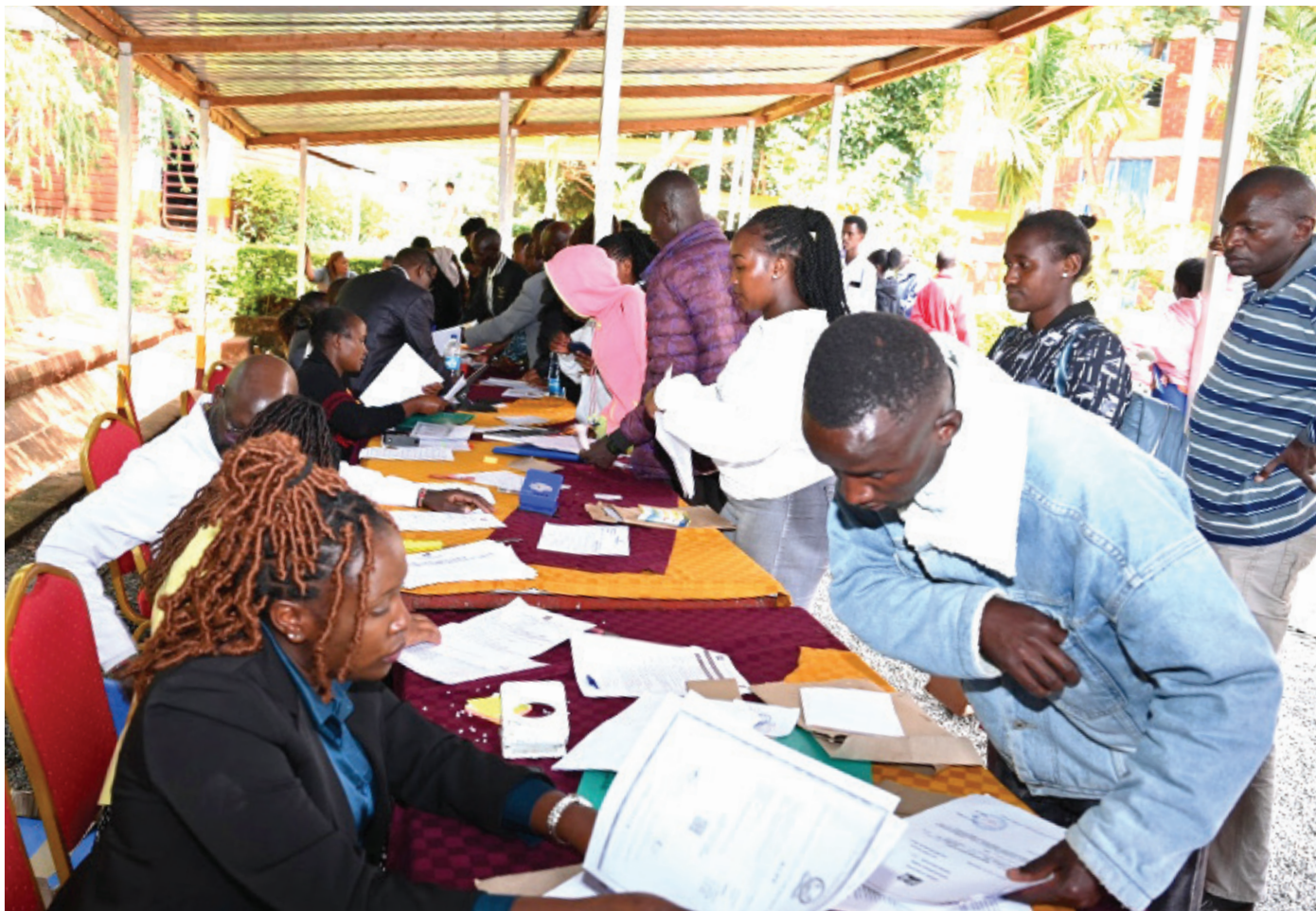
Machakos Campus during the March 2025 admission.

T he College marked a significant milestone on March 18, 2025, as thousands of first-year students reported to various Campuses across the country, officially beginning their journey in medical training.