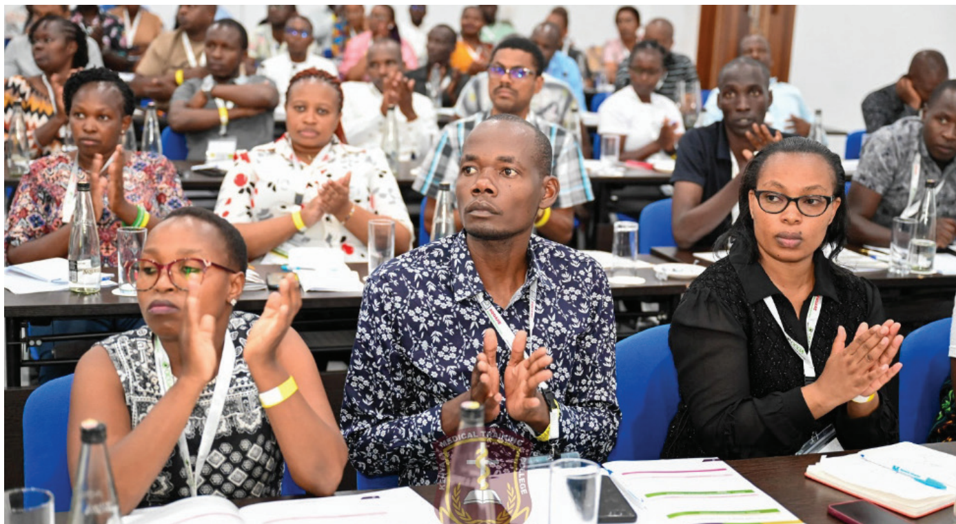
A section of participants and members of the Ophthalmic Clinical Officers Association during their annual Conference in Malindi.

A s the College marks a century of excellence, its impact on the ophthalmic sector continues to shape the future of eye care by equipping professionals with the expertise to serve communities across the country and beyond. This year's Annual Ophthalmic Clinical Officer Association Conference, held at Diamonds Hotel in Malindi from March 5th to 7th, 2025 provided a platform for KMTC to showcase its legacy as a globally competitive institution dedicated to training human resources for health.