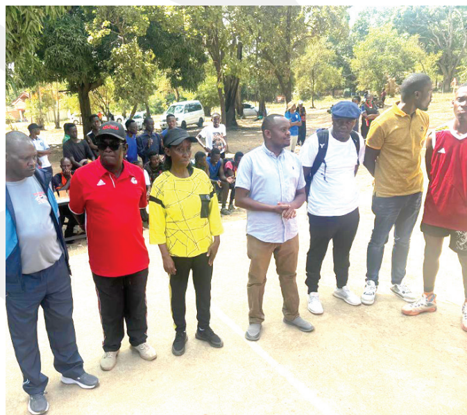
Zone 2 Sports competition in Kitui.

Teams that qualify at the zonal level will proceed to compete at the next level.