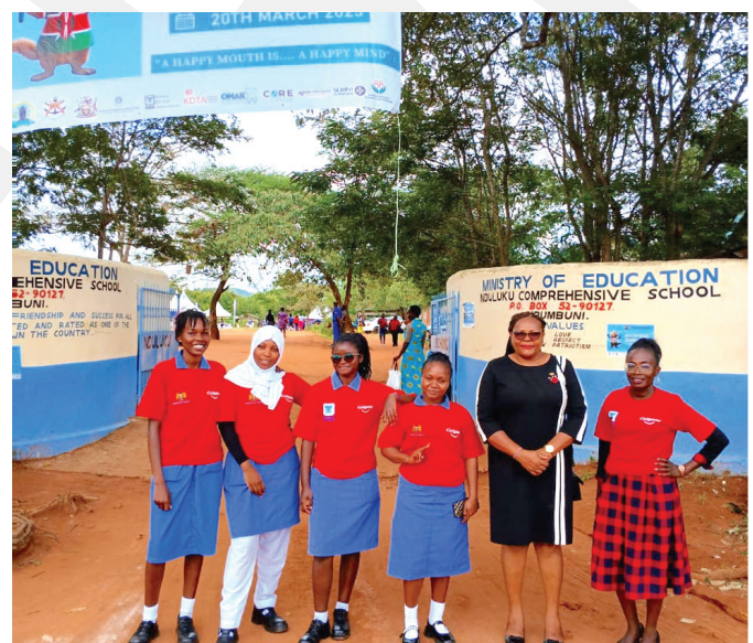
Mbooni Campus during World Oral Day celebrations in Makueni County.