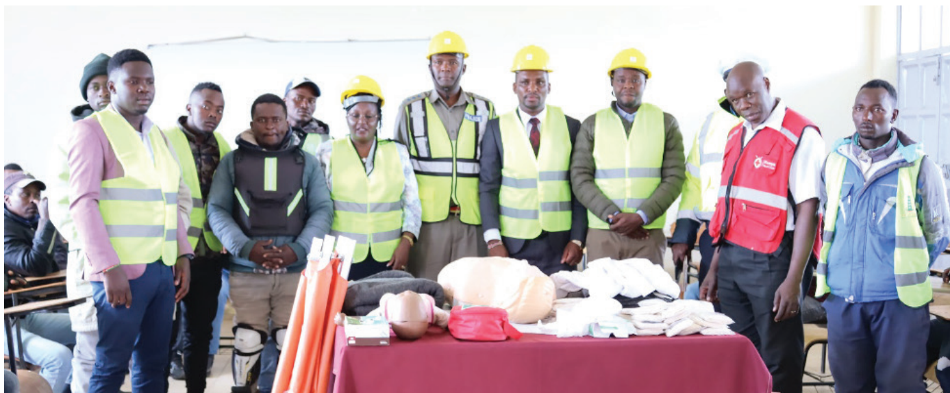
Stakeholders during a training in Nyandarua Campus.

It is not uncommon for medical colleges to offer training in life-saving skills needed during emergencies. But what if such training is extended to boda boda riders?