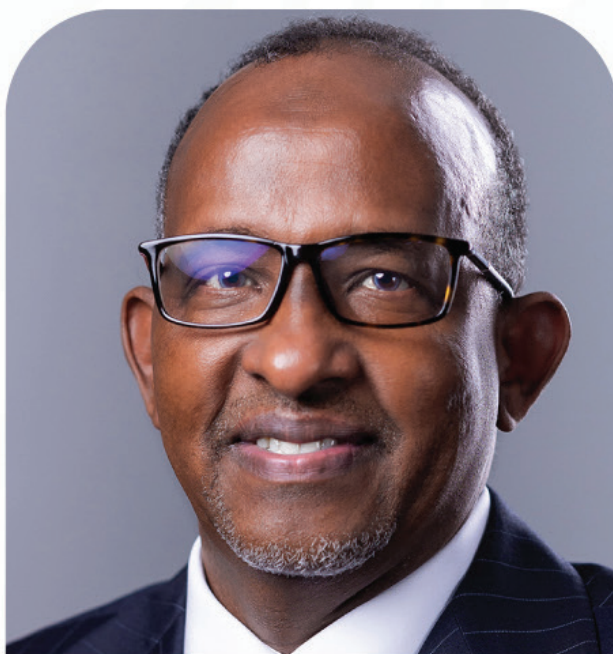
Hon. Aden Duale, E.G.H. Cabinet Secretary, Ministry of Health

The Board of Directors, Management, Staff, and Students of Kenya Medical Training College (KMTc) congratulate Hon. Aden Duale, E.G.H. on his appointment as Cabinet Secretary, Ministry of Health. We wish you all the best as you serve our great nation of Kenya. Congratulations!