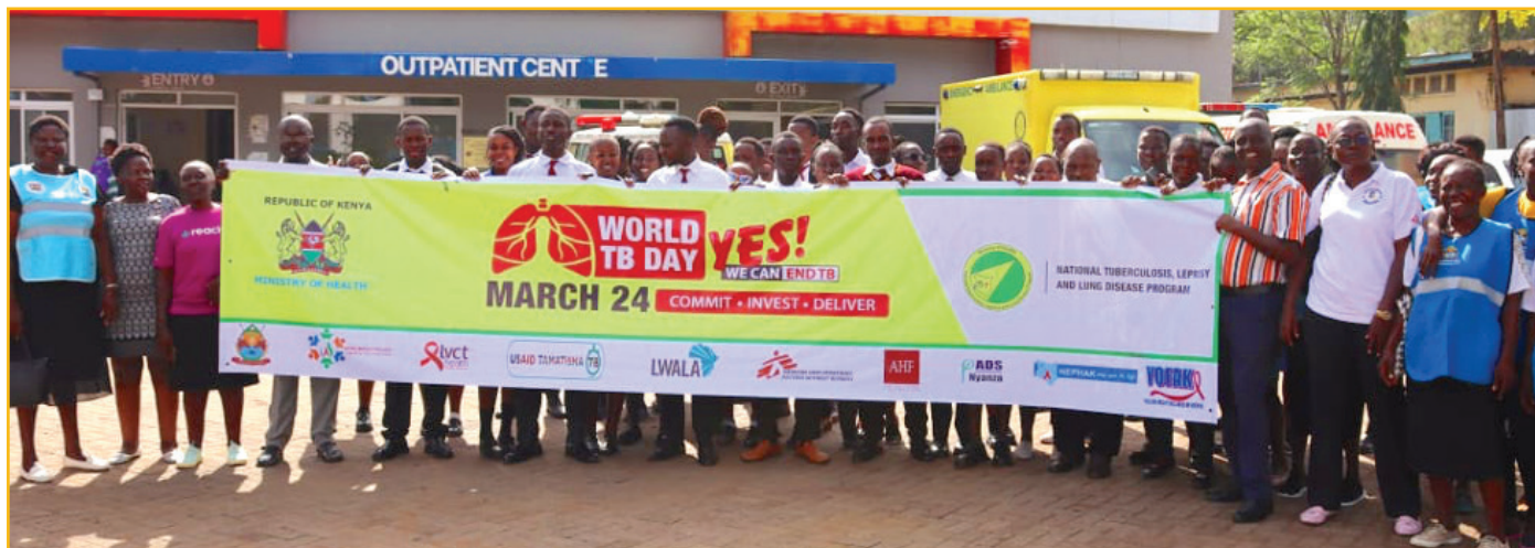
Homabay Campus on March 24, 2025 during the World Tuberculosis Day.