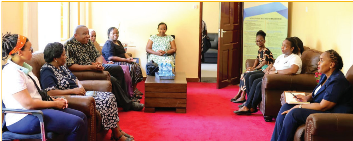
Beyond Zero team and KMTCC courtesy call to Deputy Governor Kilifi County March 18, 2025.