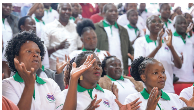
A section of KUDHEIHA members during the elections.