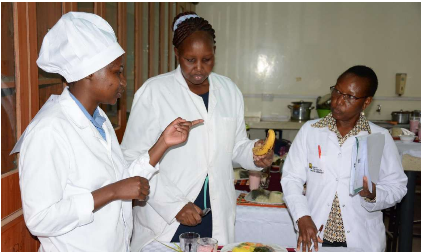
A Nutrition and Dietetics student (left) being assessed on meal management by 2 examiners during a past final qualifying examination