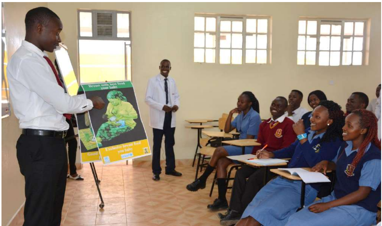
Health Promotion student leading his colleagues during a microteaching session in the classroom