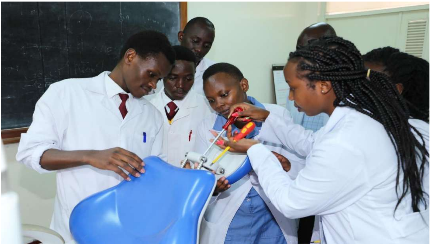
Medical Engineering students demonstrate a skill during a practical lesson