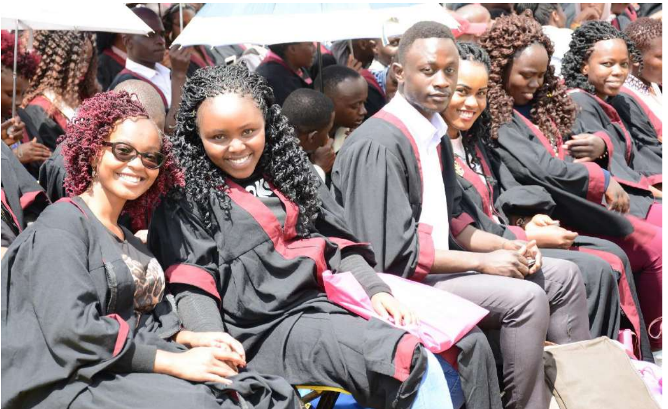
A section of graduands follow proceedings at a past Graduation Ceremony.