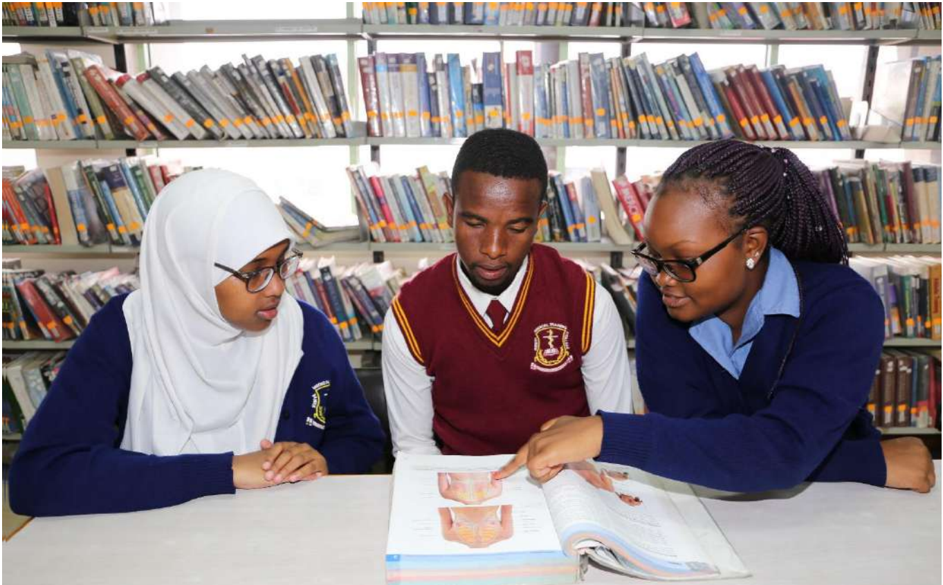
A section of the students during their private studies in the library