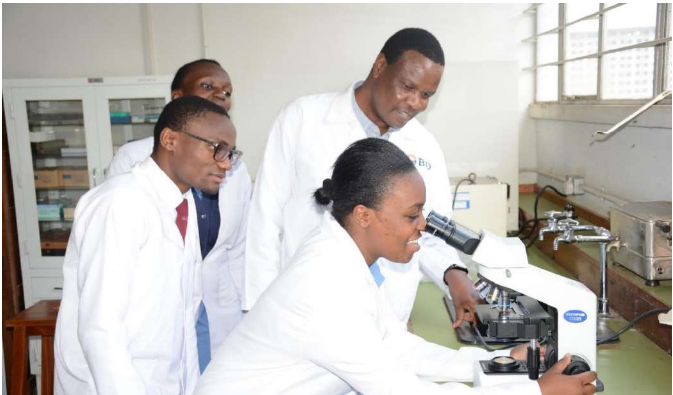
Medical laboratory student perform a return demonstration as her colleagues and lecturer look on.