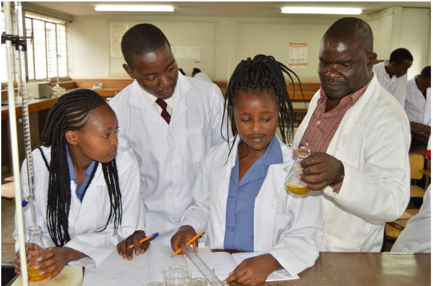
A group of Pharmacy students during a practical session in one of the laboratories