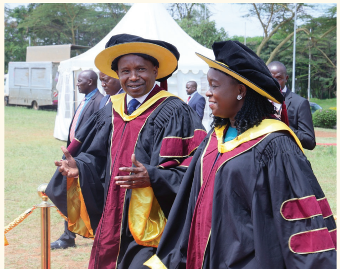
Deputy President Prof. Kithure Kindiki and Health CS Dr. Deborah Barasa.