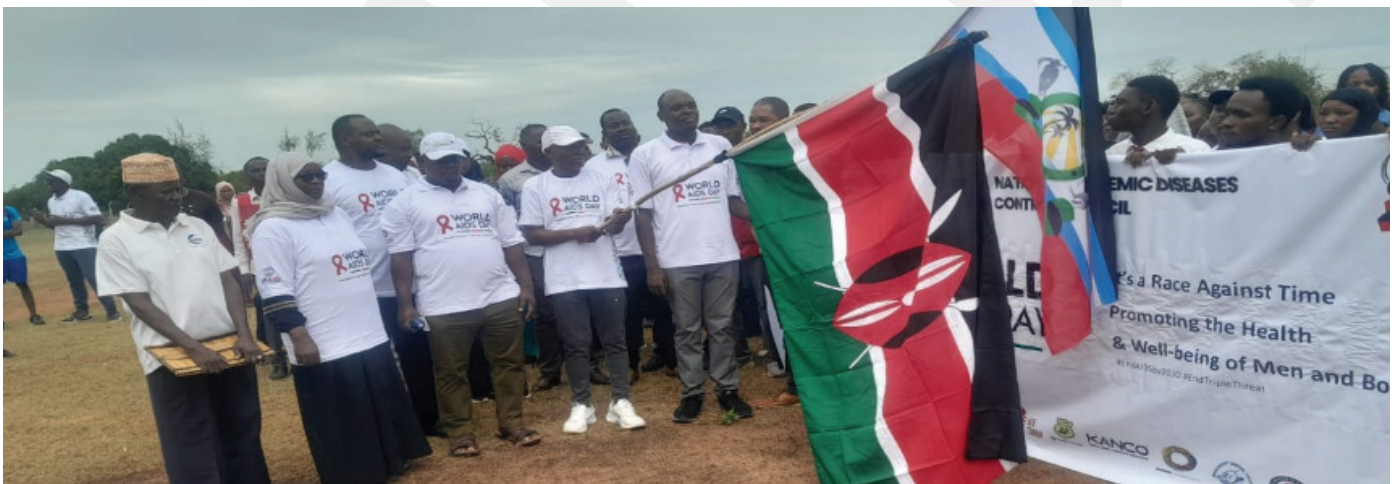
Kwale and Msambweni Campuses.