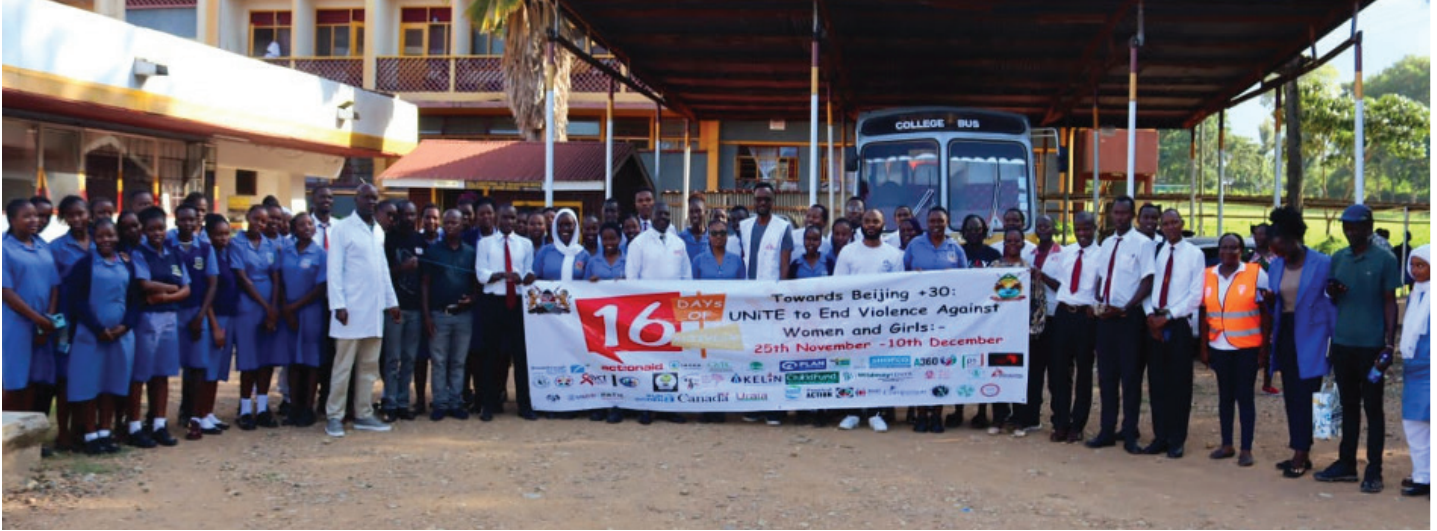
KMTC Homabay Campus partnered with MSF to raise awareness on Gender-Based Violence as part of the 16 Days of Activism campaign.