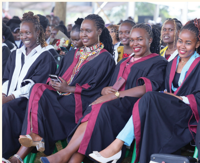
A Section of Graduands.