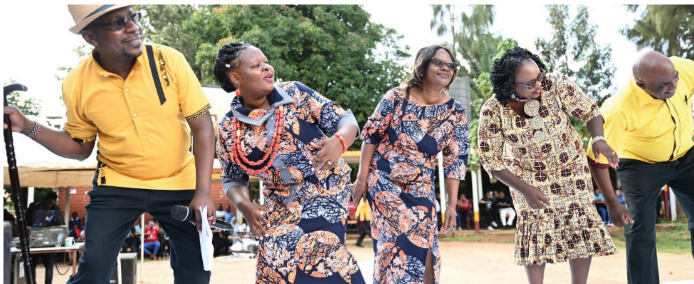
Machakos Campus Cultural Day.