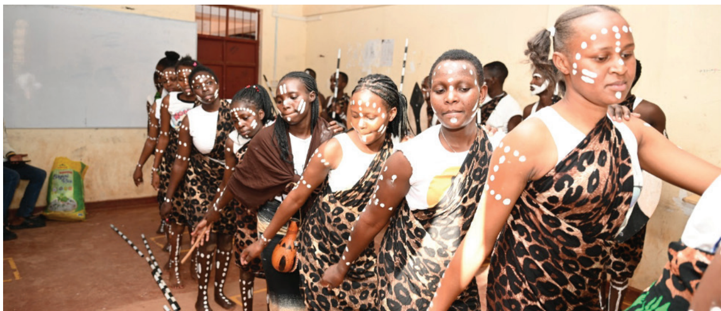
Machakos Campus Cultural Day.