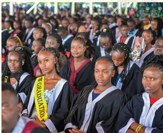
A Section of the Graduands.