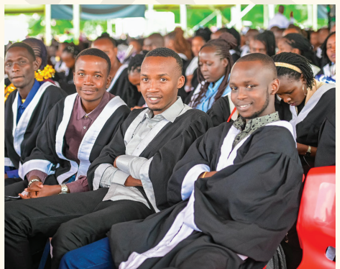
A Section of the Graduands.