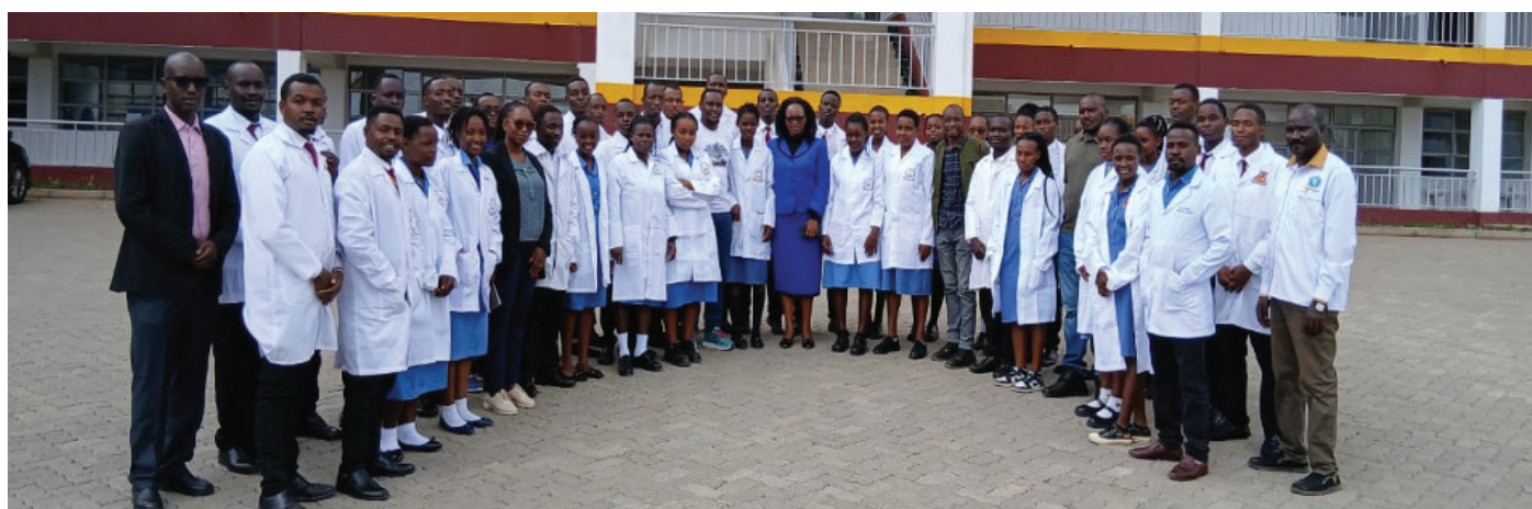
Narok Campus hosted KCOA and KUCO representatives for an induction session, equipping Clinical Medicine students with professional insights and career guidance.