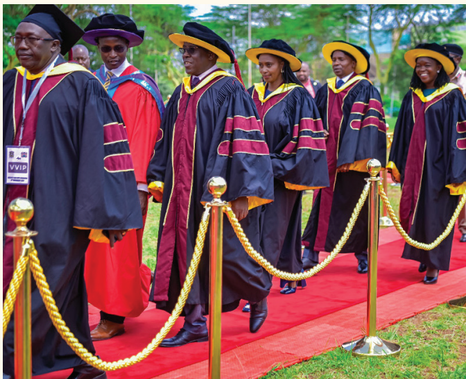
Prof. Kithure Kindiki, Health CS Dr. Debora Mulongo and a Section of Board Directors during the procession.