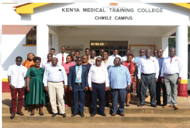
Board Directors and Staff during a visit to Chwele Campus.