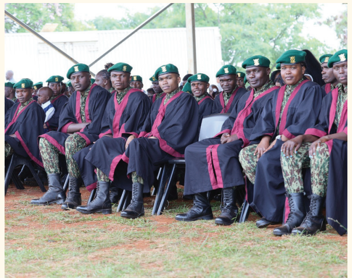
A Section of the Graduands (from the National Youth Service).