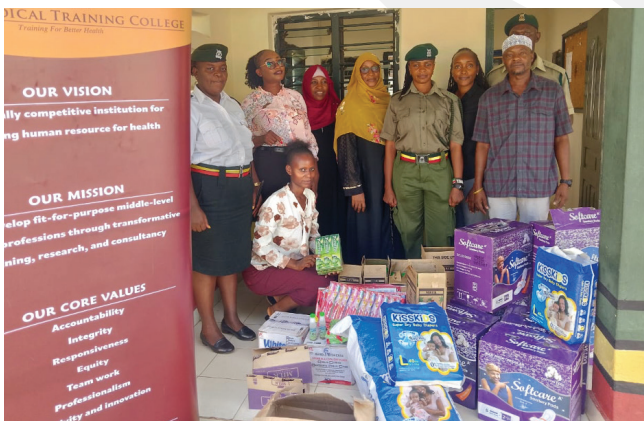
Mombasa Campus staff spread Christmas joy at Shimo la Tewa Women's Prison through donations and community engagement.