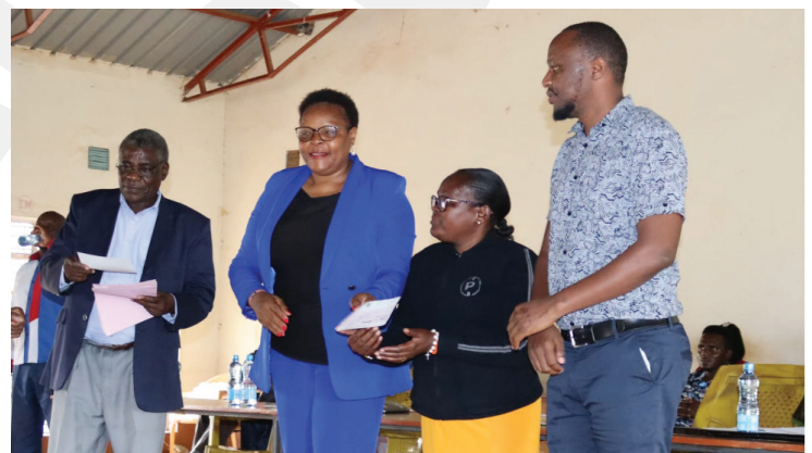
Mbooni KMTC received a Kshs. 140,000 NG-CDF cheque to boost its tree-planting initiative, enhancing sustainability and environmental conservation.