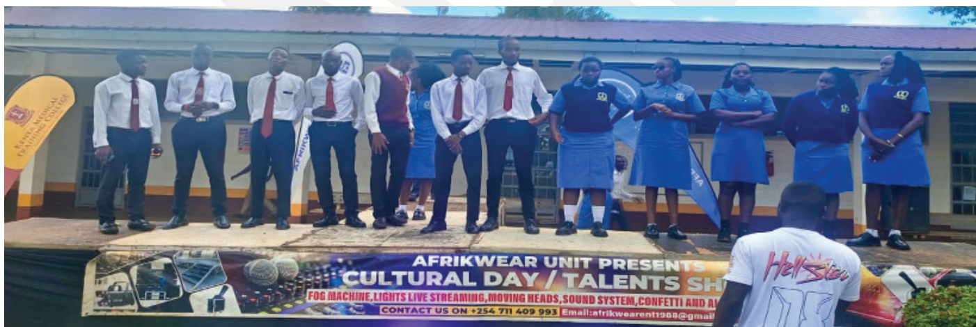
Vihiga Campus Cultural Day.