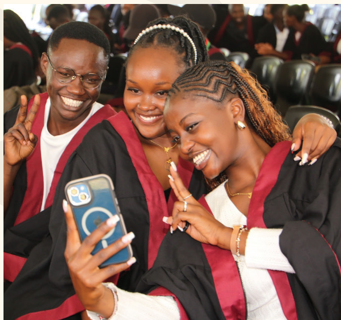
A Section of the Graduands.

He encouraged graduates to explore international job opportunities, noting that the government supports programs such as foreign language courses and pre-departure training to enhance their global competitiveness.