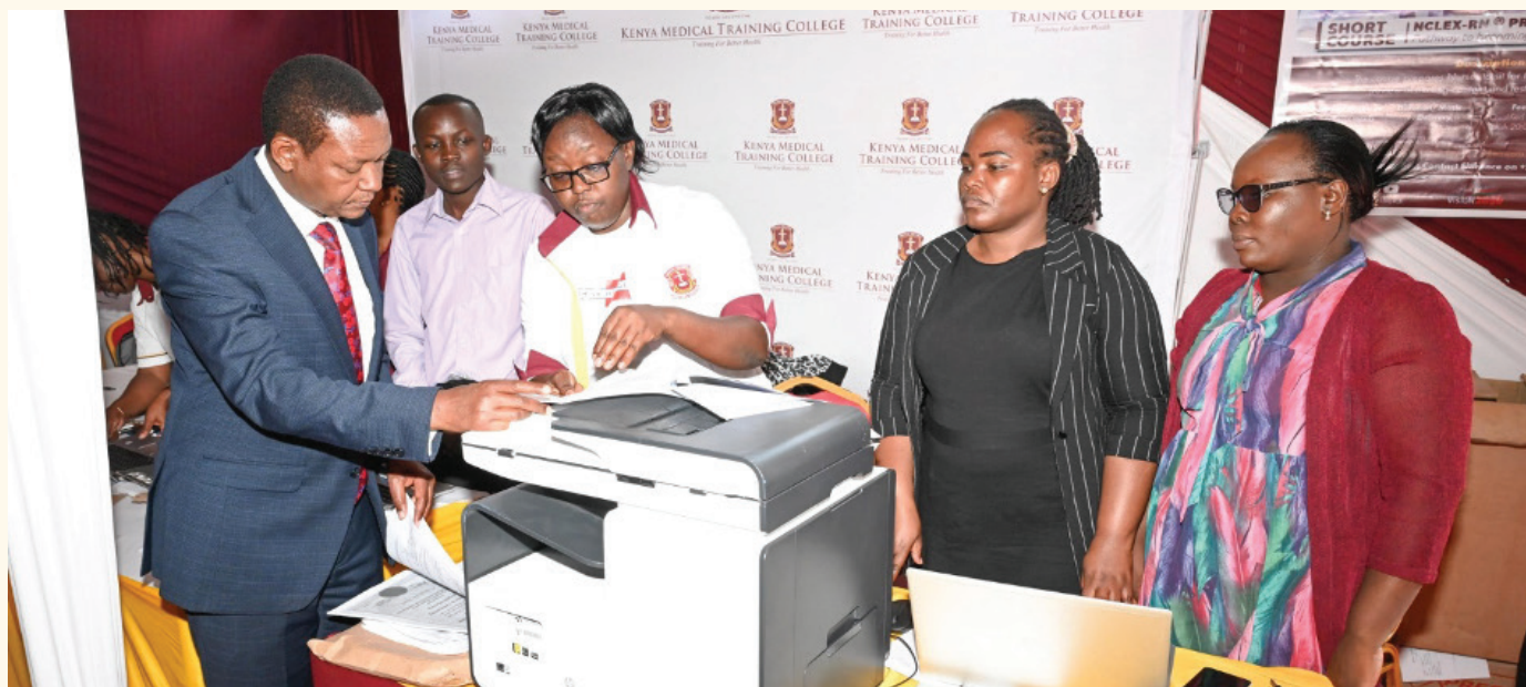
Cabinet Secretary for Labour and Social Protection Dr. Alfred Mutua during his visit to the KMTC booth.

T he College has made a significant impact at the Jamhuri National Job Fair, taking place from December 5 th to 11 th , 2024, at the Kenyatta International Convention Centre (KICC) in Nairobi. Under the theme “Expanding Local Opportunities for Youth Employment,” this transformative event brings together key players from the government and private sectors to champion youth empowerment and job creation.