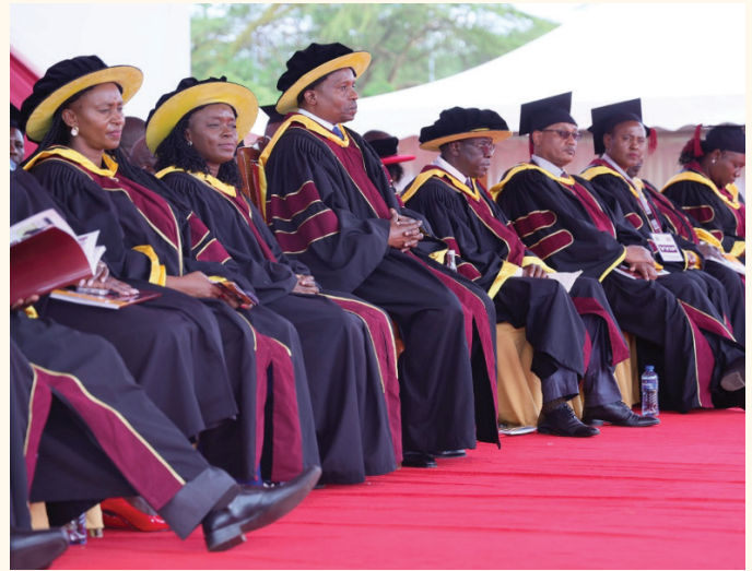
Deputy President Prof. Kithure Kindiki (4 th left) with a section of Board Directors and Management.