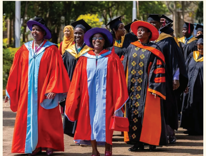
A section of Campus Principals during the procession.