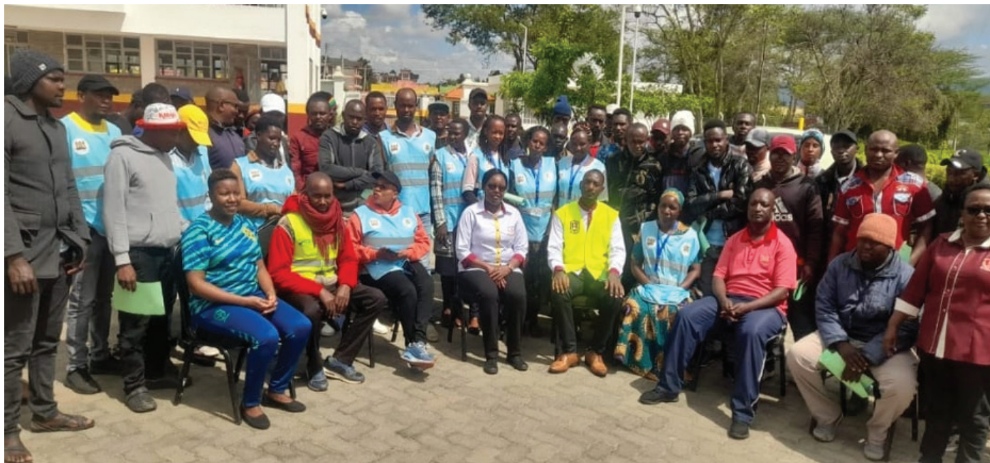
Manza campus during the training of bodaboda riders and CHPs on bystander's emergency response.