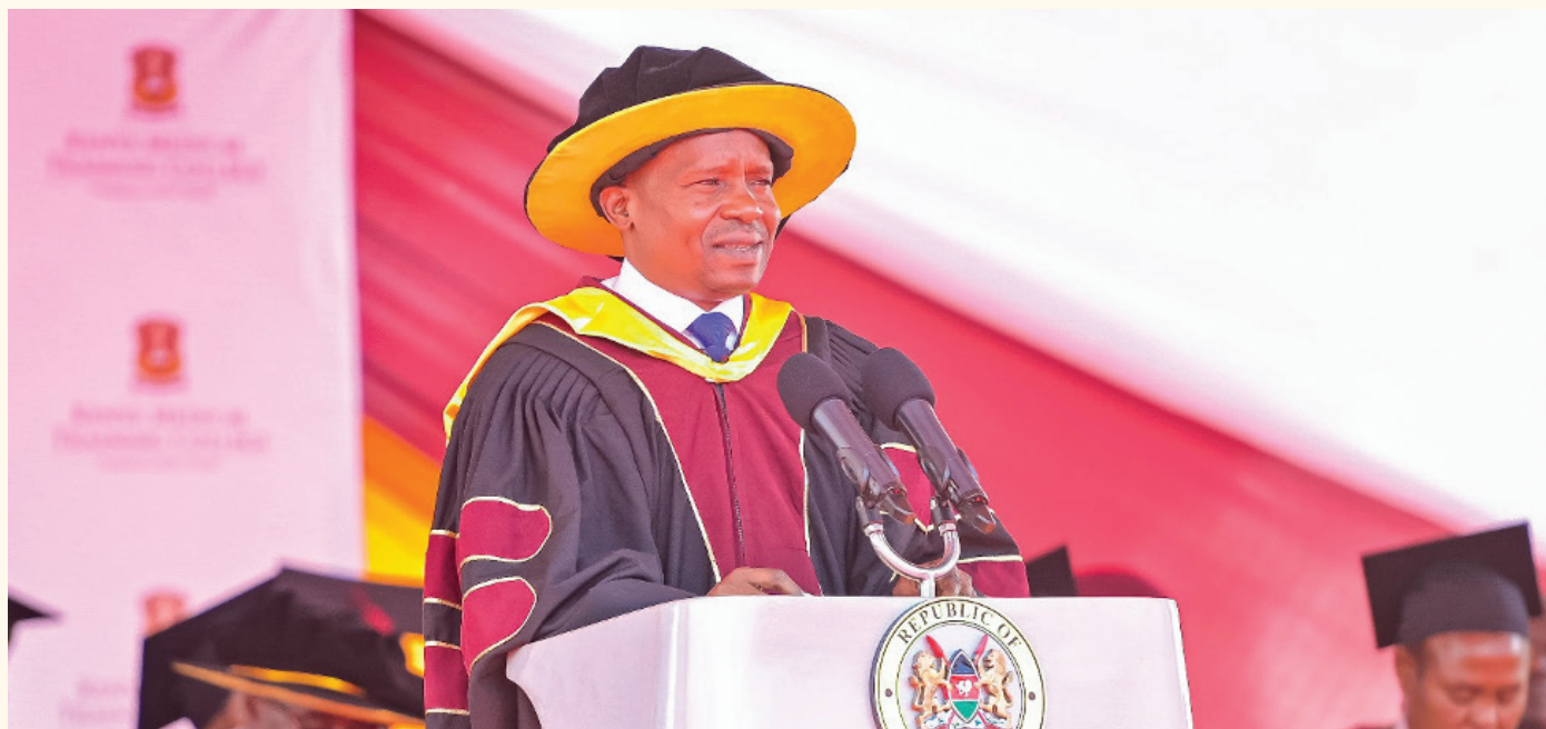
Chief Guest Deputy President Prof. Kithure Kindiki during the graduation.

T he College graduated 21,261 students on December 5, 2024, in a vibrant ceremony at Moi Sports Center, Kasarani.