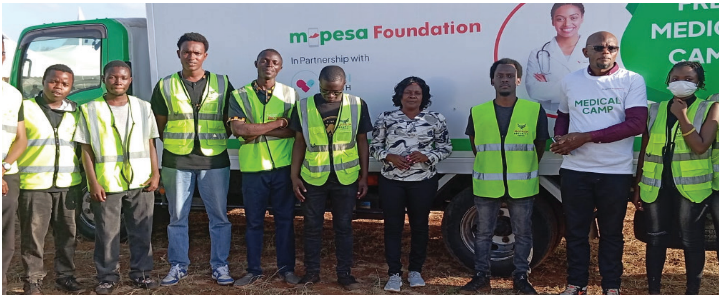
Isiolo Campus joined hands with M-Pesa Foundation and Zuri Health to hold a medical camp in Isiolo Town, providing essential healthcare services to the community.