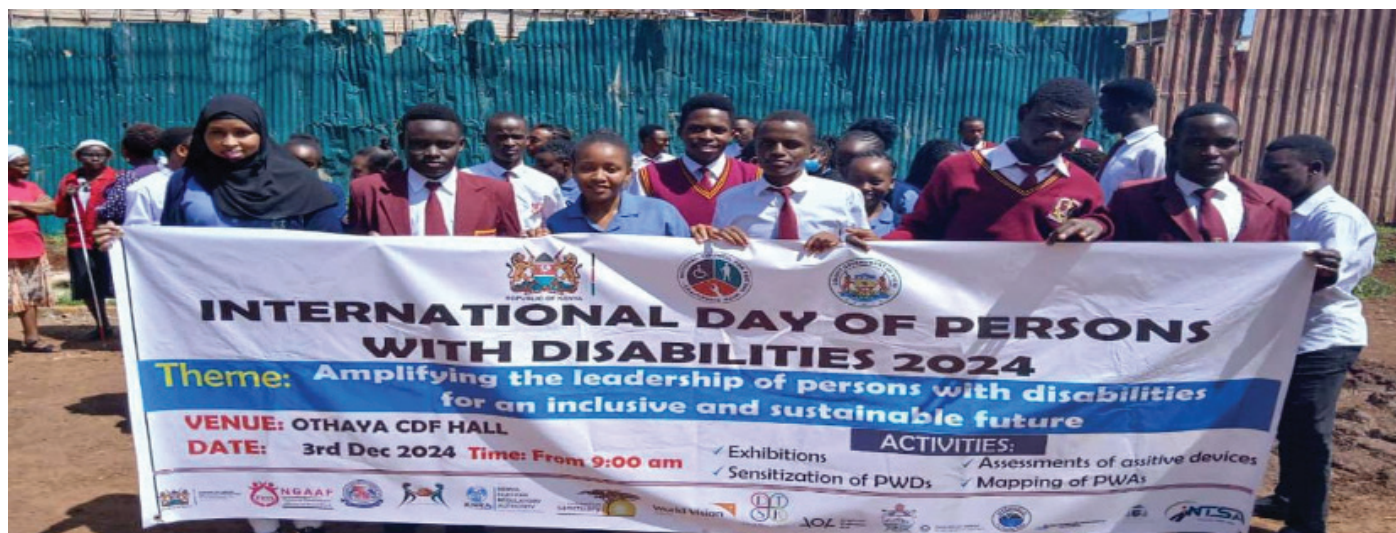
Nyeri Campus during the International Day for People with Disability (December 3, 2024)