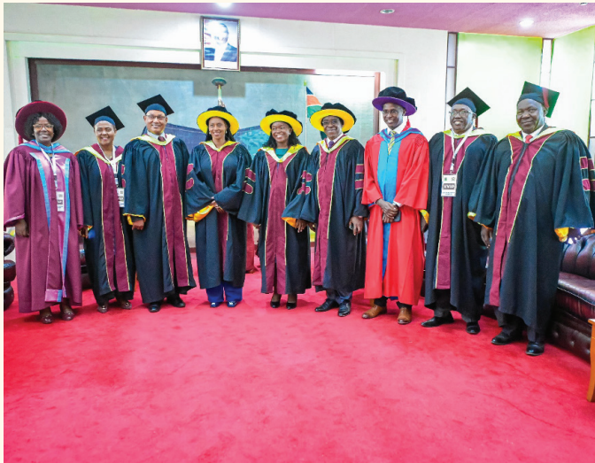
Health CS, PS, a section of KMTC Board Directors and Management.