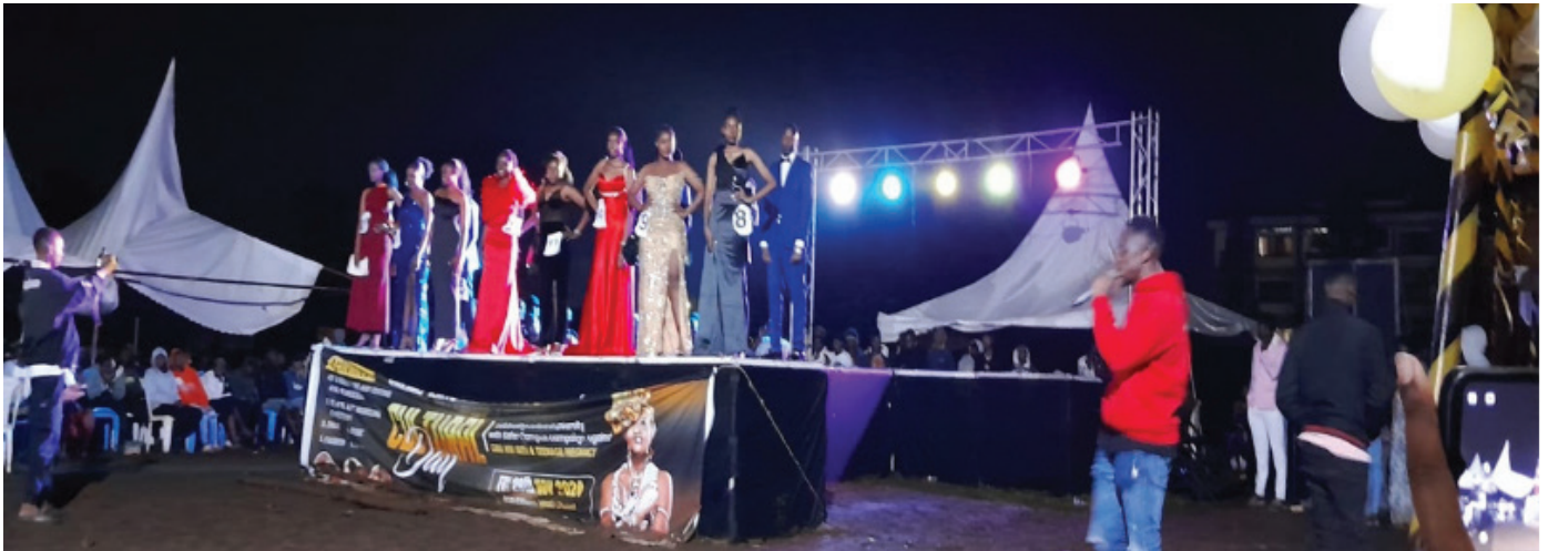
Kisumu Campus Cultural Day.