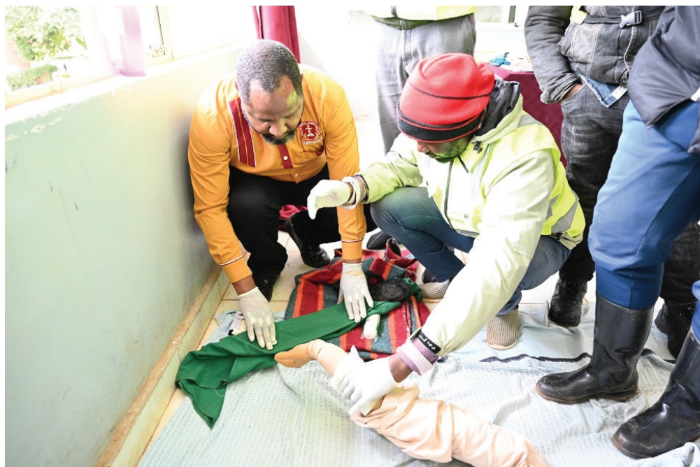
An ongoing training at Machakos Campus.

Cardiopulmonary resuscitation (CPR) techniques were taught using manikins representing adults, children, and infants, allowing riders to practice age-