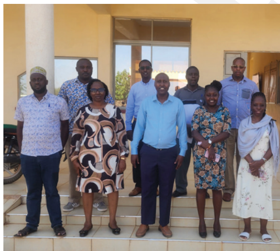
Mandera Campus hosted a delegation from the Ministry of Health, National Treasury, and KMTCHQ for an assessment of its operational and infrastructural needs.