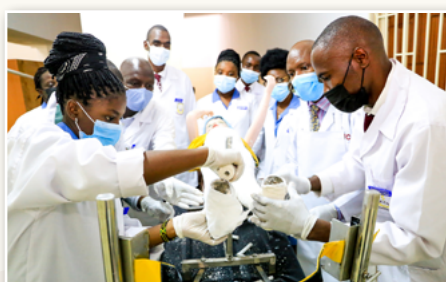
Orthopaedic and Trauma Medicine