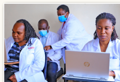
Health Professions Education