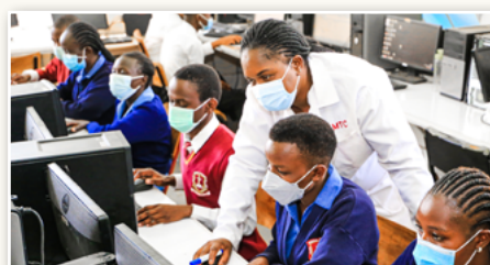
Health Records and Information Technology