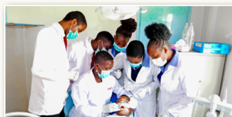
Community Oral Health