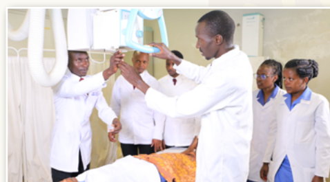
Radiography and Imaging