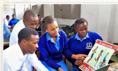
Health Promotion and Community Health