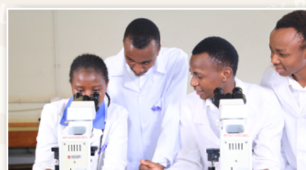
Medical Laboratory Sciences