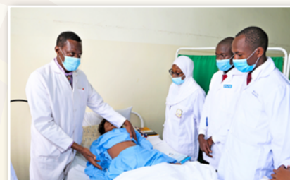
Clinical Medicine and Surgery