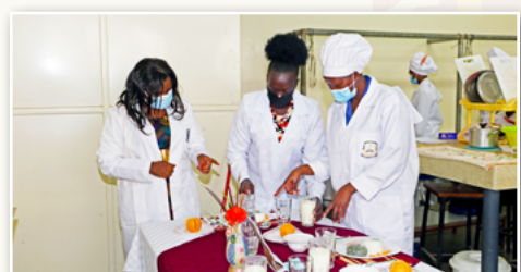
Nutrition and Dietetics